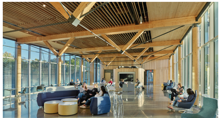
UNIVERSITY OF ARKANSAS, ADOHI HALL Fayetteville, AR