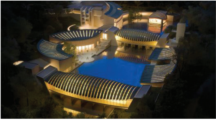
CRYSTAL BRIDGES MUSEUM OF AMERICAN ART Bentonville, AR