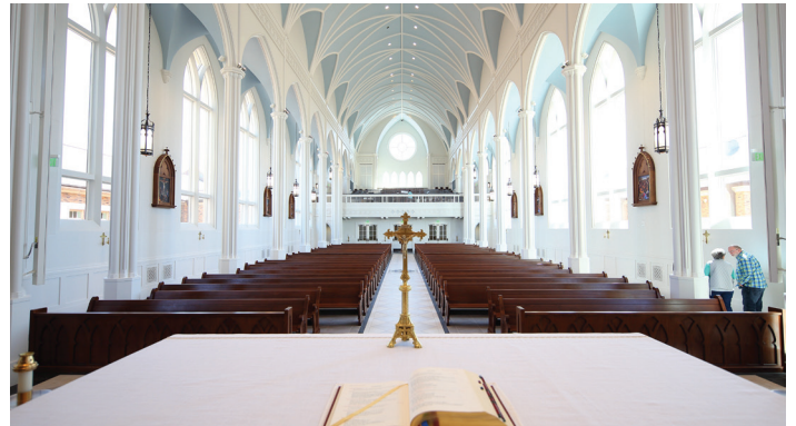
ST. FRANCIS XAVIER CATHOLIC CHURCH Stillwater, OK