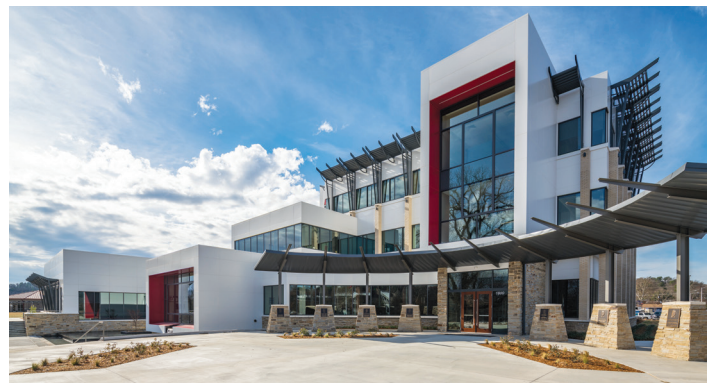
ATA INTERNATIONAL HEADQUARTERS Little Rock, AR