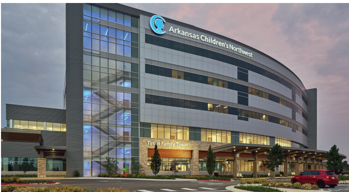
ARKANSAS CHILDREN'S NORTHWEST Springdale, AR