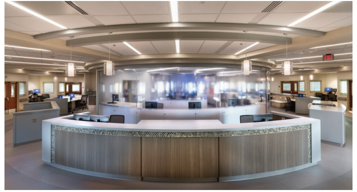
HUTCHINSON REGIONAL MEDICAL CENTER Hutchinson, KS