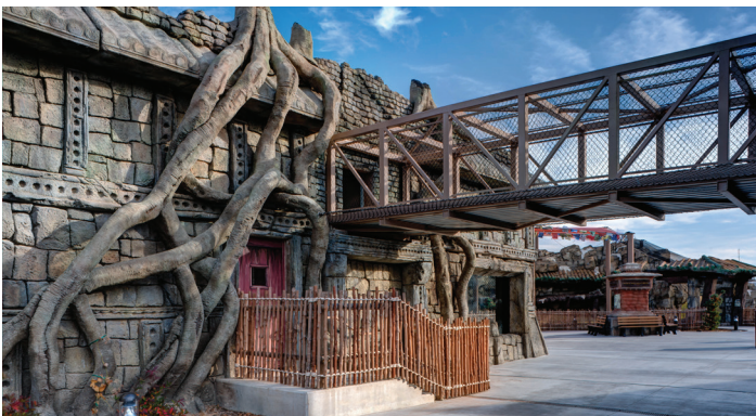
TULSA ZOO LOST KINGDOM EXHIBIT Tulsa, OK