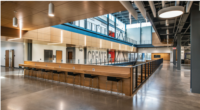
JEFFERSON CITY HIGH SCHOOL Jefferson City, MO