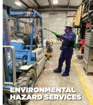
ENVIRONMENTAL HAZARD SERVICES