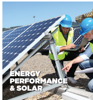
ENERGY PERFORMANCE & SOLAR