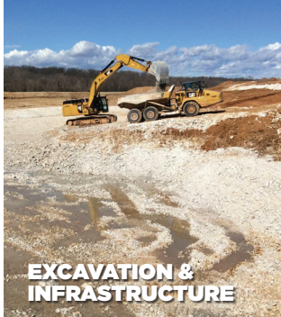
EXCAVATION & INFRASTRUCTURE