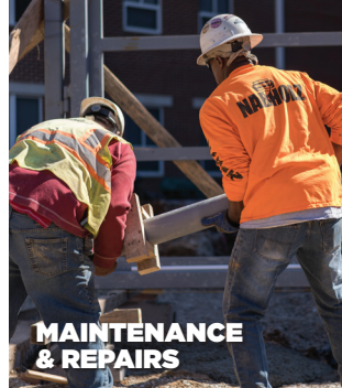
MAINTENANCE & REPAIRS