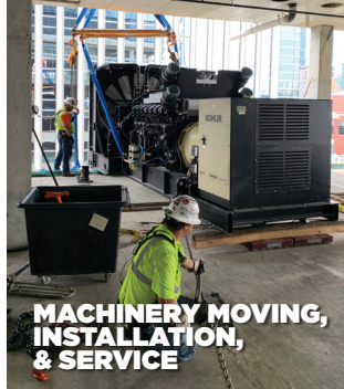
MACHINERY MOVING, INSTALLATION, & SERVICE