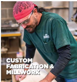
CUSTOM FABRICATION & MILLWORK