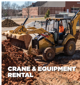
CRANE & EQUIPMENT RENTAL